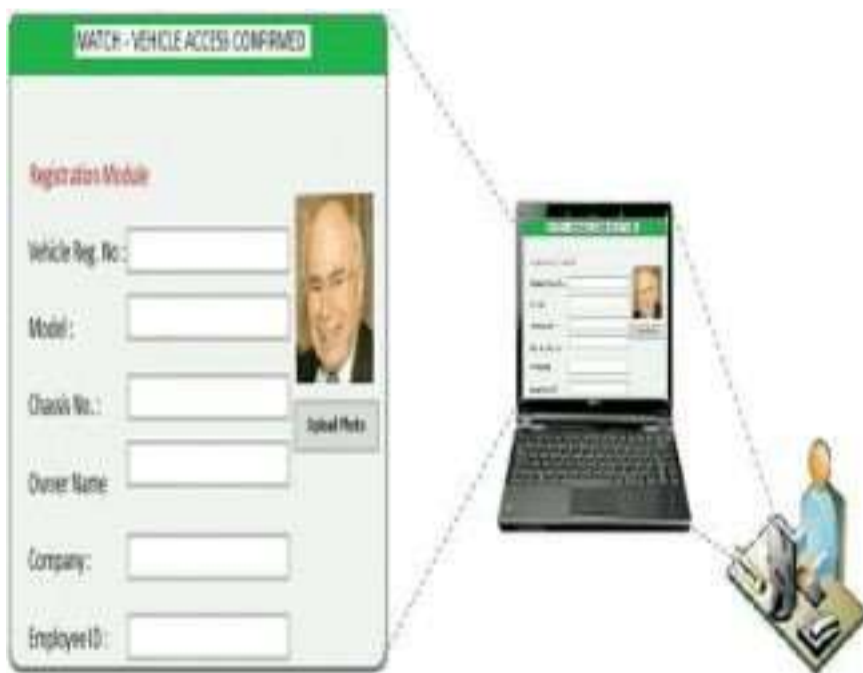
Fig1.6 REGISTRATION AND ALERT APPLICATION