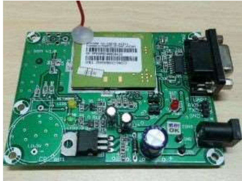
1.3 GSM MODEM PROJECT