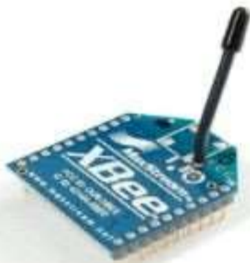
1.2: Zigbee module